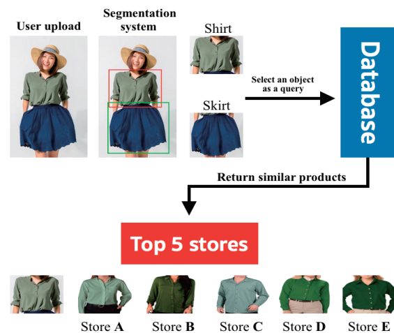
Figure 2: Customer searches for a product

the image by using image segmentation via a Deep Learning algorithm. The user can select a product they want (e.g. shirt, skirt, etc.) as a query to search for a similar product in the database. Then, the system will retrieve all available products which match the query according to their similarity together with their availability at stores. The customer searches for a product as shown in Figure 2.